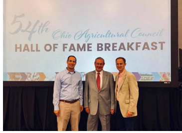
OABA Industry Education Committee Chairman was inducted into the Ohio Ag Hall of Fame in August.